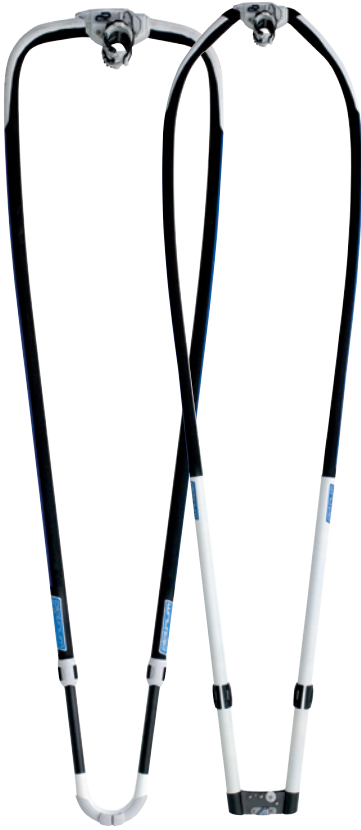
PLATINUM WAVE RACE